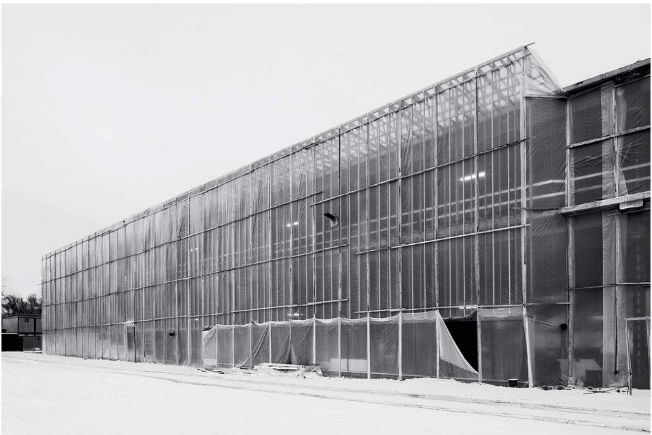
The Koolhaas-designed structure, still under construction, opens in June.