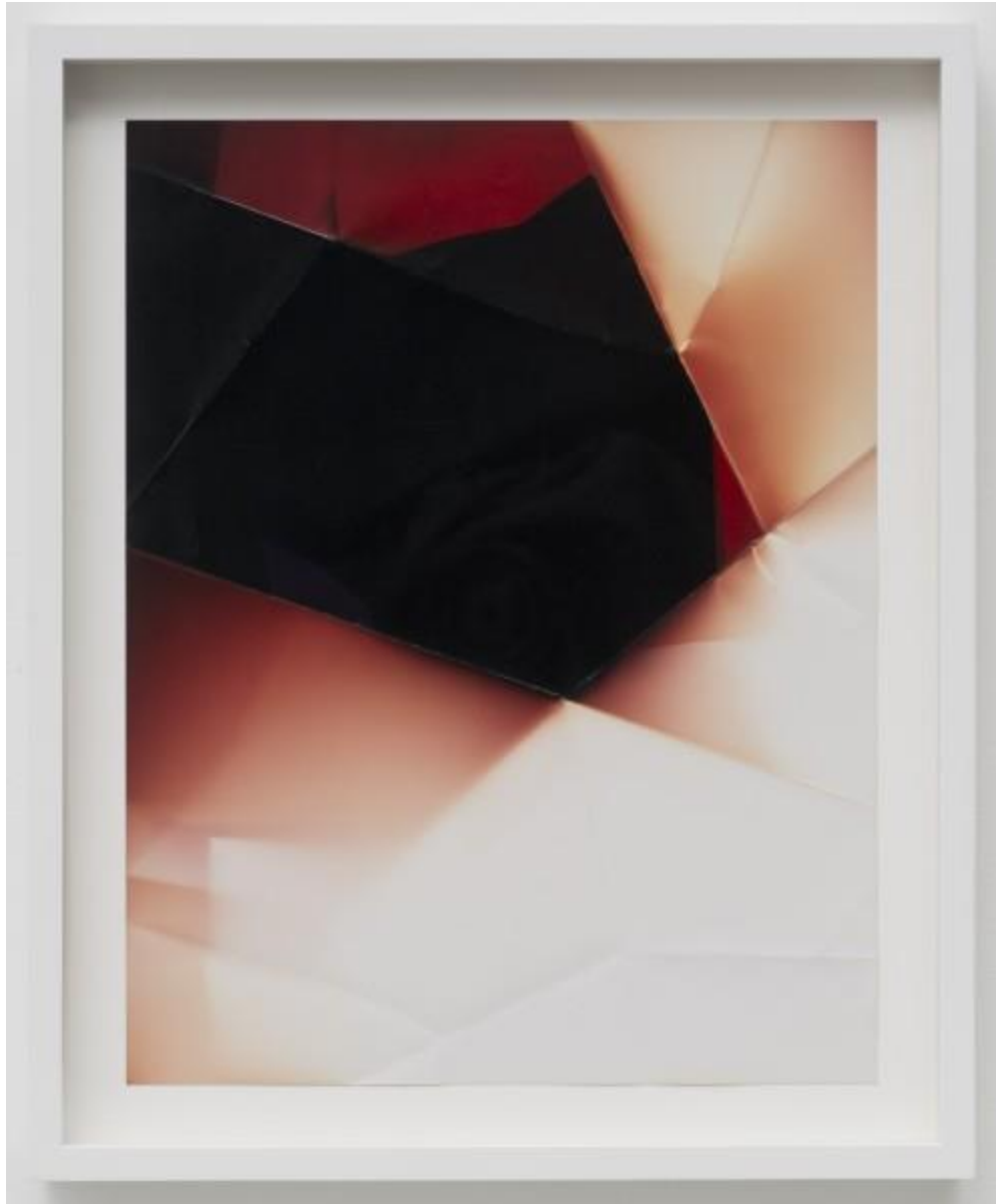
Walead Beshty, "Two Sided Picture (YR)," 2013, color photographic print, 14" x 11"