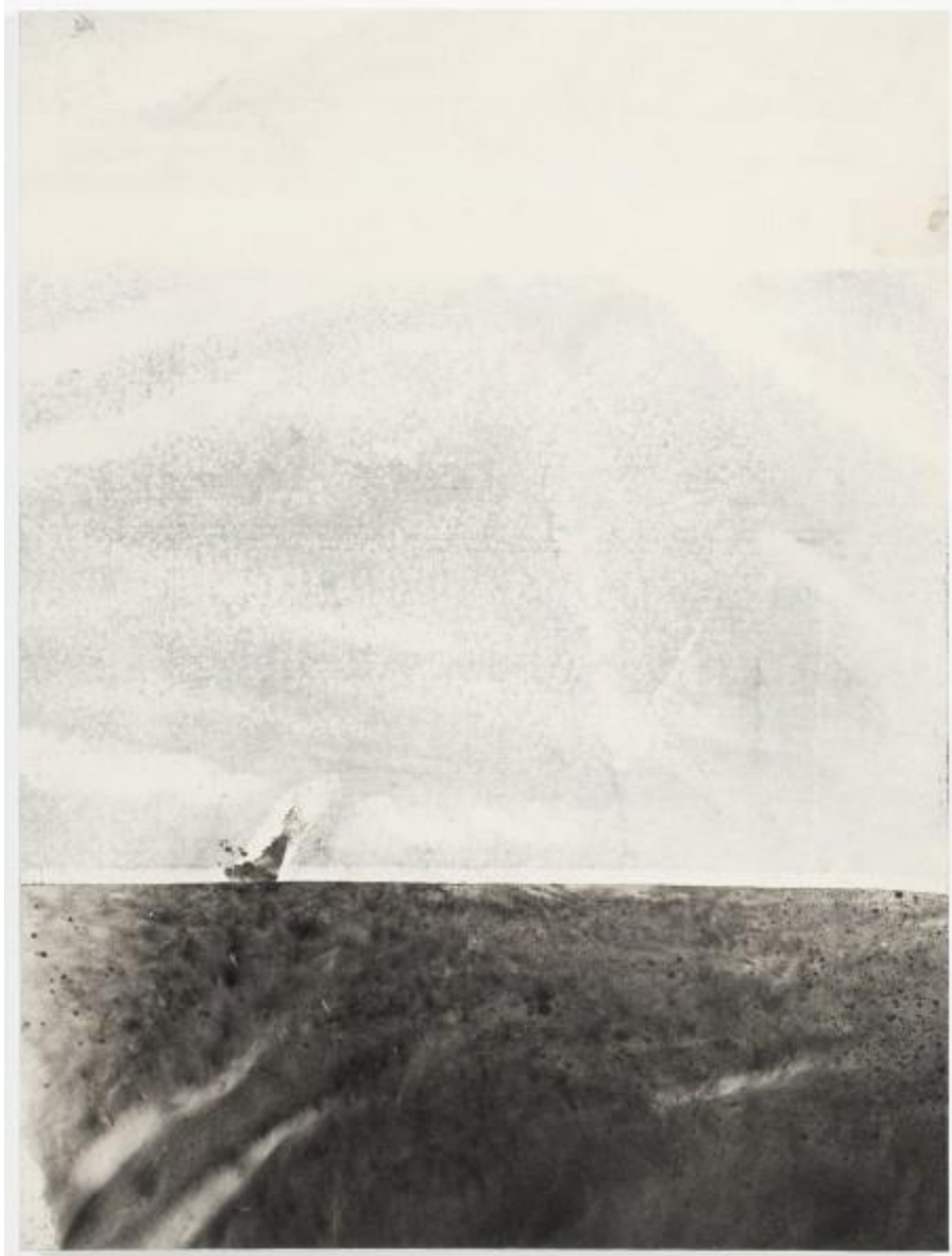
Sam Moyer, "Untitled," 2013, ink on canvas mounted to wood panel, unique 48" x 26"