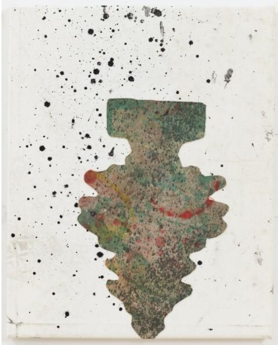
Nate Lowman, "January Tree," 2013, mixed media on canvas, unique, 20" x 16" (Image courtesy of the artist and Maccarone).