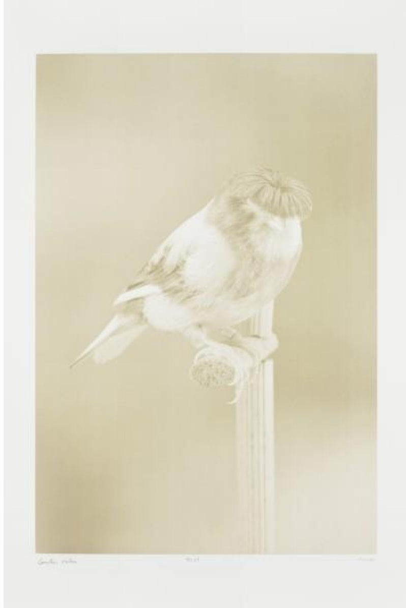
Carsten Holler, "Canaries (3)," 2009, engraving on paper, edition of 24, 24" x 34" (Image courtesy of the artist)