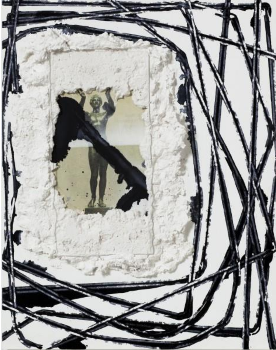
Anna Ostoya, "Intoxications No. 8," 2013, shellac and paper, 16" x 20"