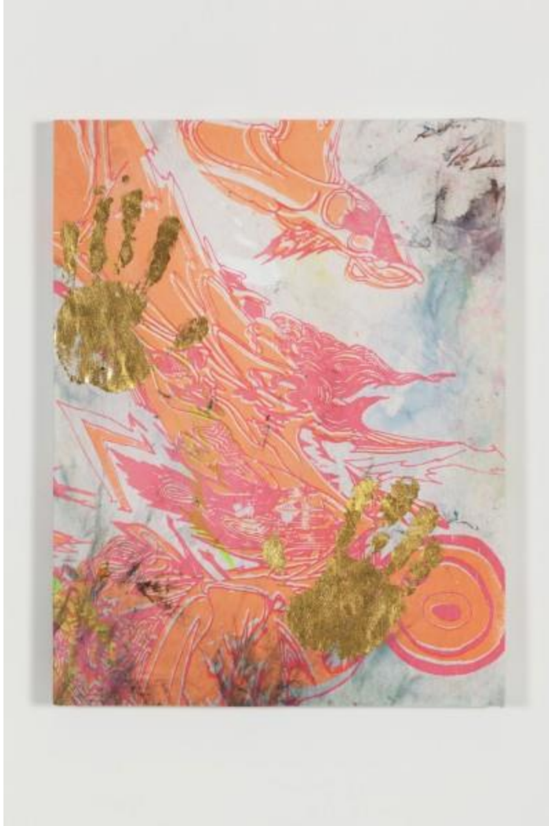
Korakrit Arunanondchai, "The Touch," 2009 – 2013, gold foil and acrylic on paper, unique, 22" x 16"

http://blogs.artinfo.com/artintheair/2013/11/11/artsy-and-ici-team-up-for-benefit-auction-featuring-mehretu-baldessari-and-more/