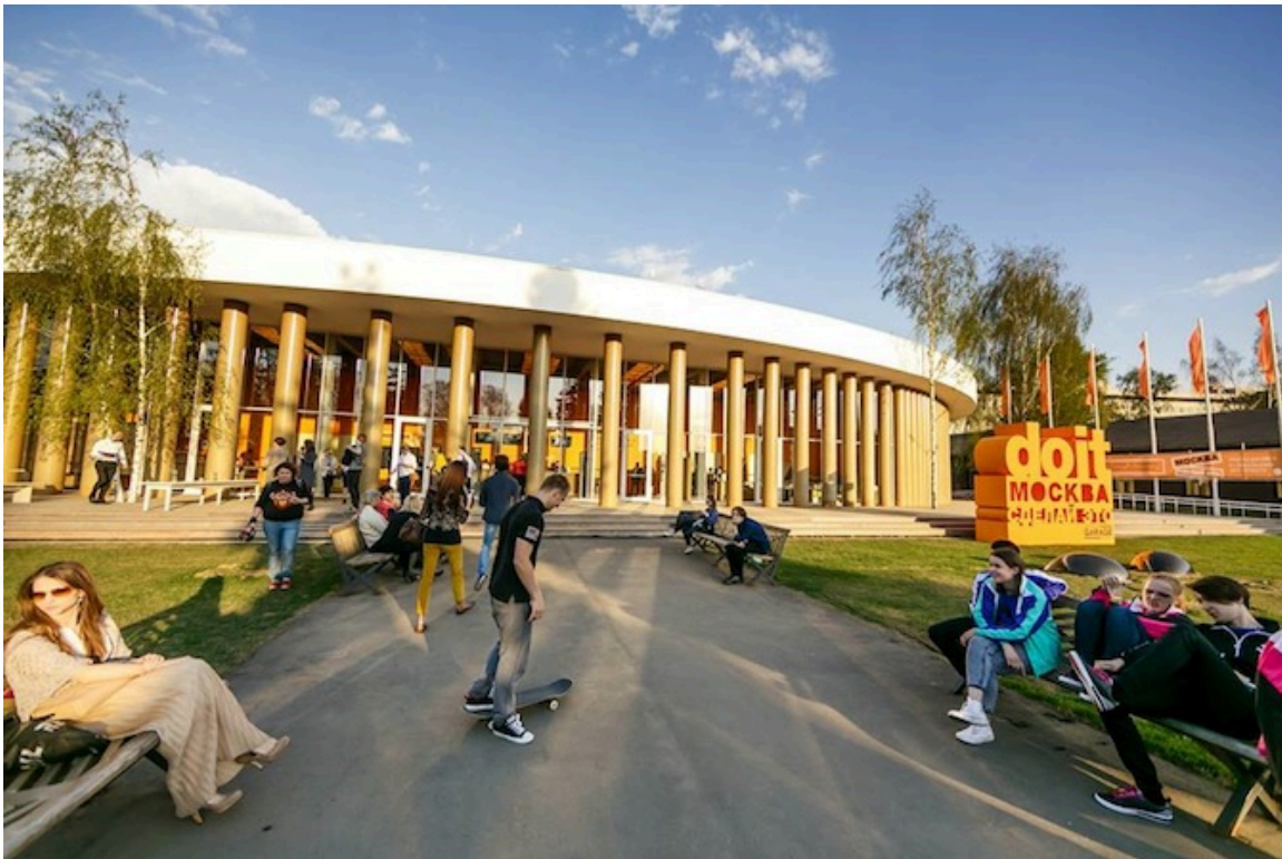
Garage Museum DO IT opening

If you ever needed an excuse to travel to Moscow, now is the time to have your assistant book a ticket. Art lovers unite as Garage Center for Contemporary Culture officially becomes Garage Museum of Contemporary Art. Changing the face of museum culture Garage is exactly what Russia needs to grow their cultural image.